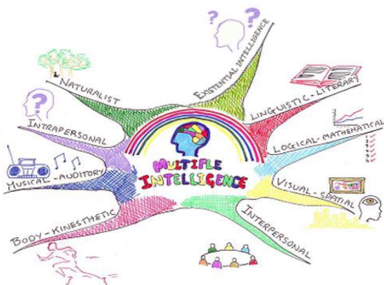
Fig. 1. Multiple intelligence model.

Considering all nine areas, it has been discovered that many have a different dominant intellectual parts. The most important thing is that all areas are stimulated to encourage development. In addition, some dominated areas can be used to help weaker parts. The Multiple Intelligence model is depicted in Fig. 1.