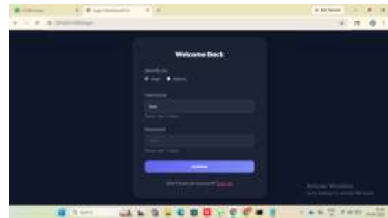
Screen 2: Login Page