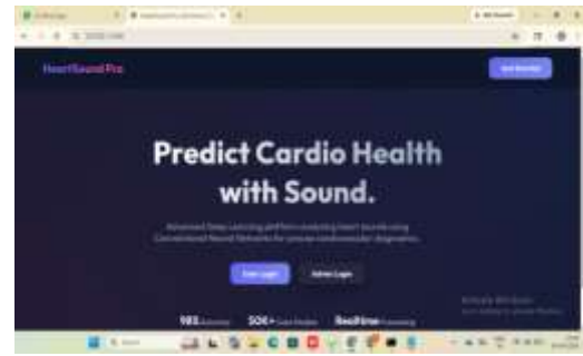
Screen 1: Home Page