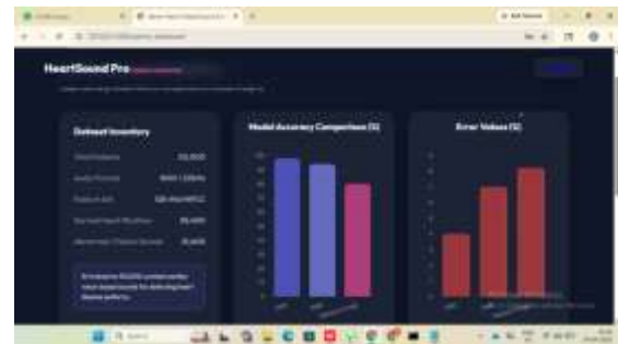
Screen 3: Accuracy Page